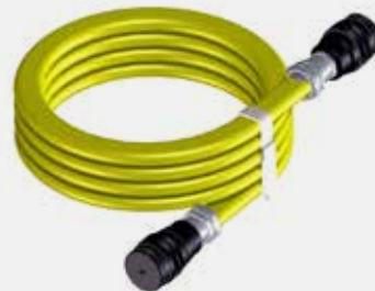
Connecting cable – 5016060210