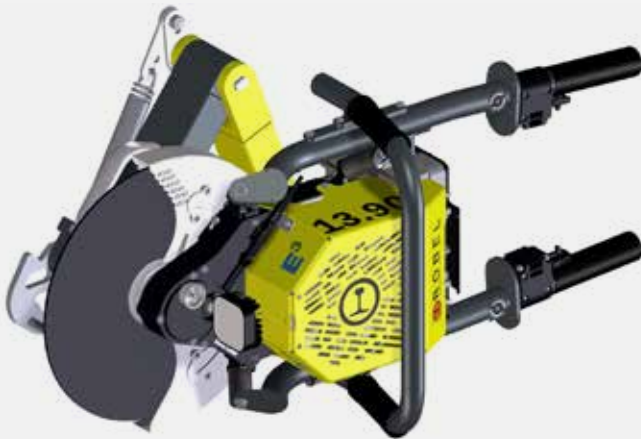
ROCUT 13.90 – 5909900008