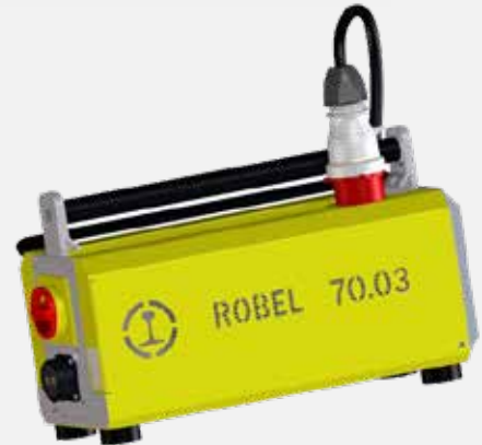
400 Volt power supply – 5039900003