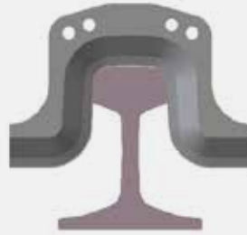
Shear blade FORM A (with riser)