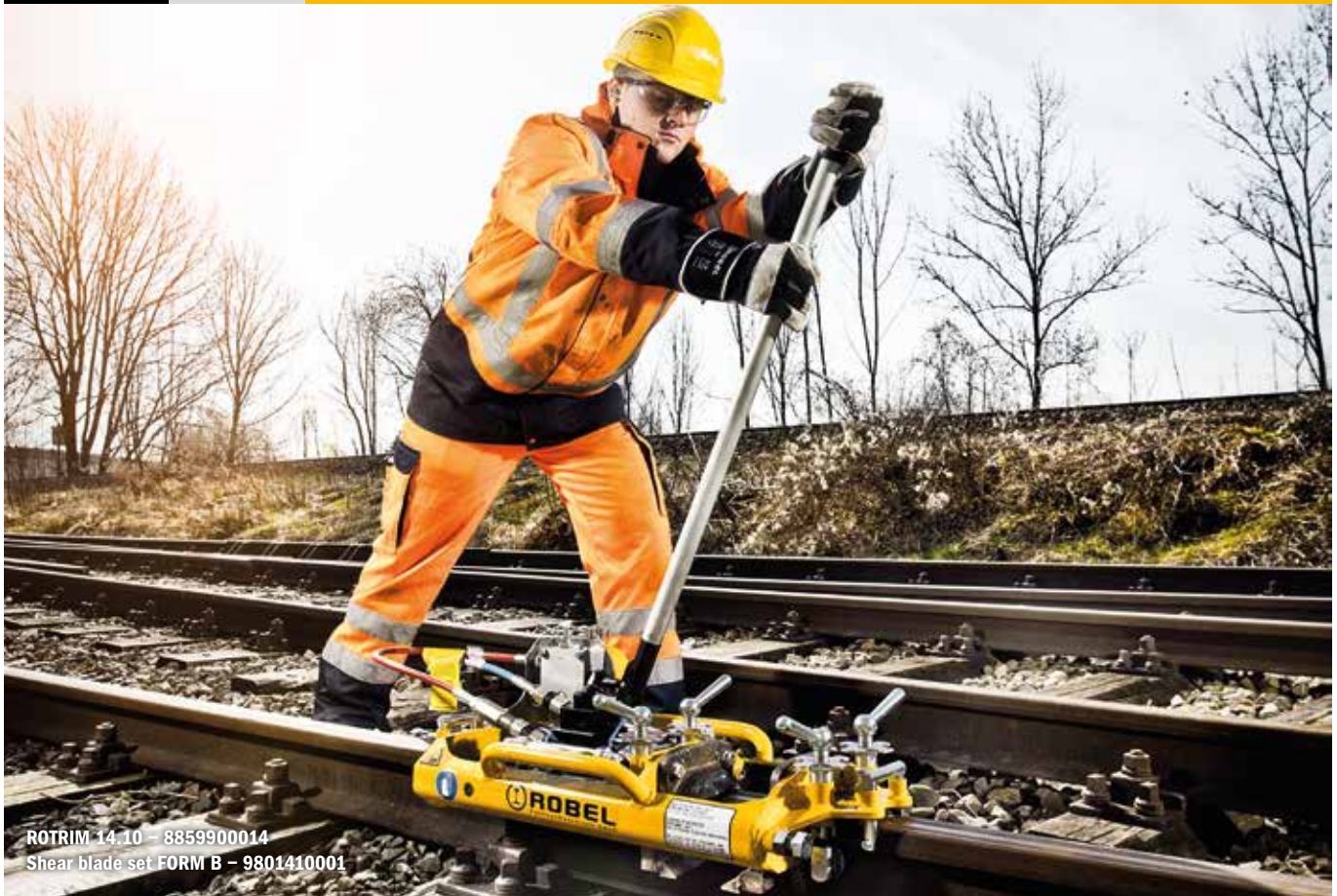
ROTRIM 14.10 - 8859900014 Shear blade set FORM B - 9801410001