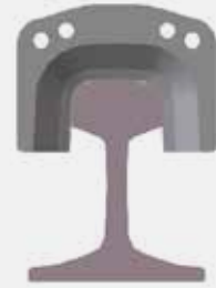
Shear blade FORM B