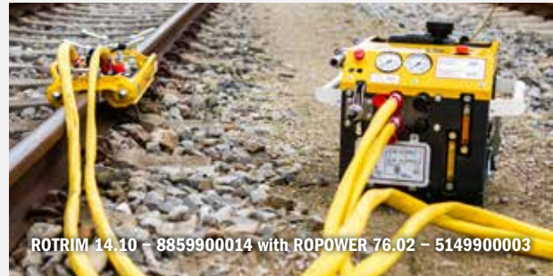
ROTRIM 14.10 – 8859900014 with ROPOWER 76.02 – 5149900003