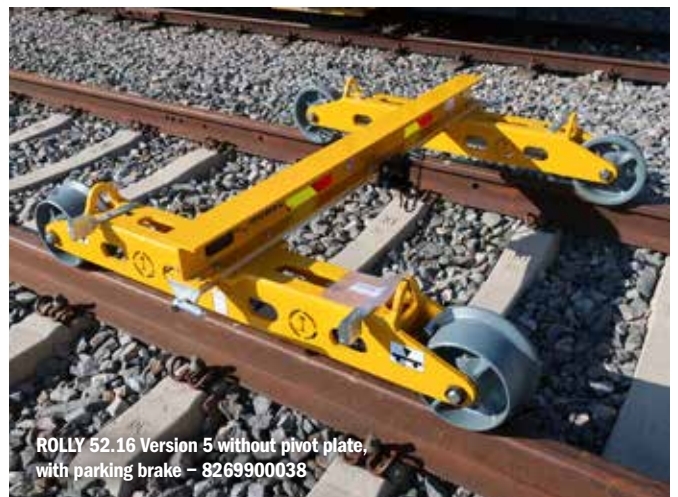
ROLLY 52.16 Version 5 without pivot plate, with parking brake – 8269900038