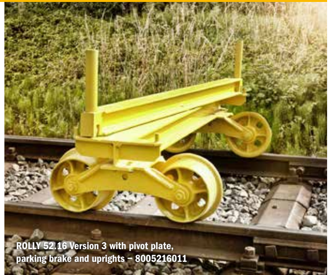
ROLLY 52.16 Version 3 with pivot plate, parking brake and uprights – 8005216011