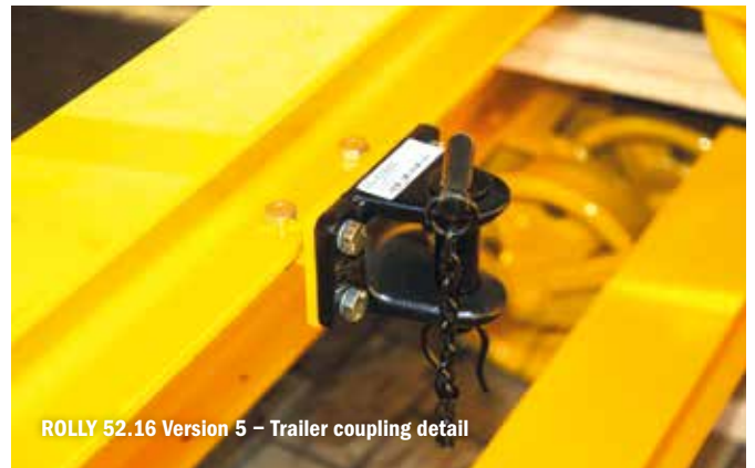
ROLLY 52.16 Version 5 – Trailer coupling detail